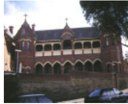
1 convent of mercy bendigo front view hall & amp; boarders building apr1997