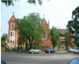
CATHOLIC COLLEGE BENDIGO SOHE 2008