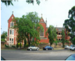
CATHOLIC COLLEGE BENDIGO SOHE 2008