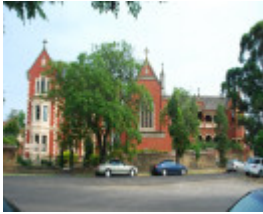
CATHOLIC COLLEGE BENDIGO SOHE 2008