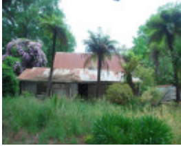
SILVERWELLS SOHE 2008