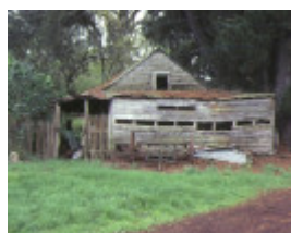
silverwells gembrook former post office & store