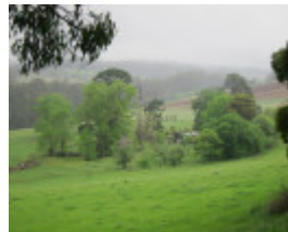
H0611 SILVERWELLS LHA 2015 1.JPG