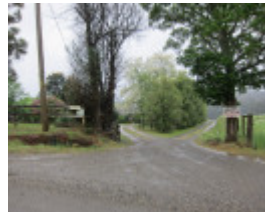
H0611 SILVERWELLS LHA 2015 4.JPG