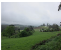
H0611 SILVERWELLS LHA 2015 2.JPG