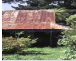
silverwells gembrook front entrance to third house oct1980