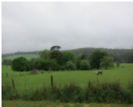
H0611 SILVERWELLS LHA 2015 3.JPG