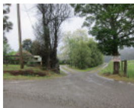
H0611 SILVERWELLS LHA 2015 4.JPG