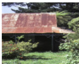
silverwells gembrook front entrance to third house oct1980