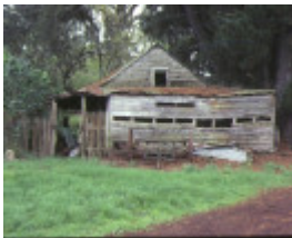
silverwells gembrook former post office & store