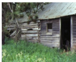
1 silverwells gembrook second house & dairy extension oct1980