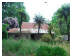
SILVERWELLS SOHE 2008