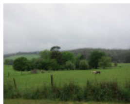
H0611 SILVERWELLS LHA 2015 3.JPG