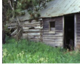
1 silverwells gembrook second house & dairy extension oct1980