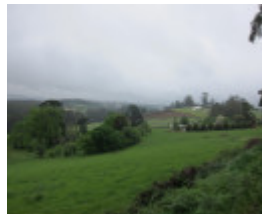
H0611 SILVERWELLS LHA 2015 2.JPG