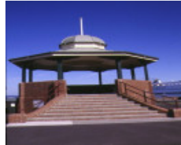
1 band rotunda beach street port melbourne front view apr1998