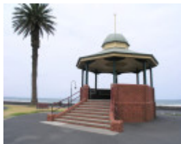
BAND ROTUNDA SOHE 2008