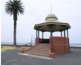
BAND ROTUNDA SOHE 2008