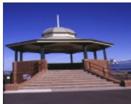
1 band rotunda beach street port melbourne front view apr1998