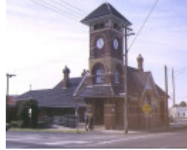
1 terang post office terang front view aug1998