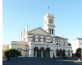
MARYBOROUGH POST OFFICE SOHE 2008