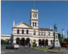
MARYBOROUGH POST OFFICE SOHE 2008