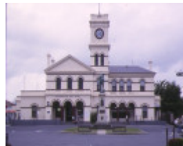
1 maryborough post office maryborough front view aug1998