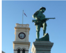
MARYBOROUGH POST OFFICE SOHE 2008