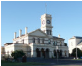
MARYBOROUGH POST OFFICE SOHE 2008