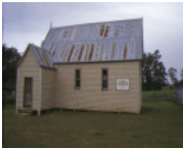
1 bendoc union church nichol street bendoc front view oct1998