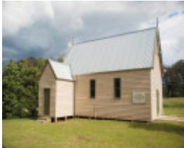
BENDOC UNION CHURCH SOHE 2008