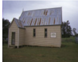
1 bendoc union church nichol street bendoc front view oct1998