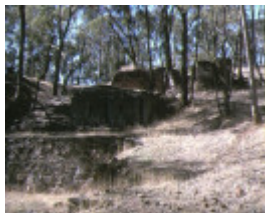
1 central cookman quartz gold mine st parkins reef road maldon landscape jun1997