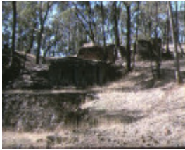
1 central cookman quartz gold mine st parkins reef road maldon landscape jun1997