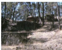
1 central cookman quartz gold mine st parkins reef road maldon landscape jun1997