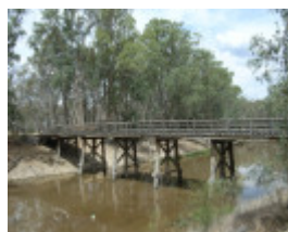
CONDIDORIOS BRIDGE SOHE 2008