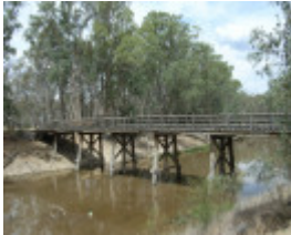
CONDIDORIOS BRIDGE SOHE 2008