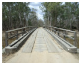
CONDIDORIOS BRIDGE SOHE 2008