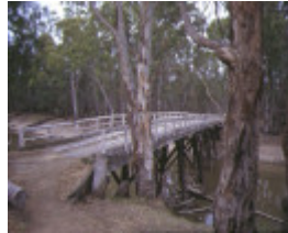
1 condidorios bridge koondrook