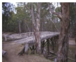
1 conditorios bridge koondrook