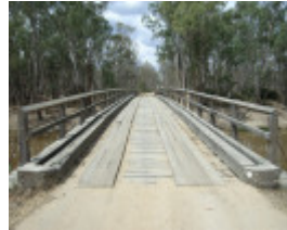
CONDIDORIOS BRIDGE SOHE 2008