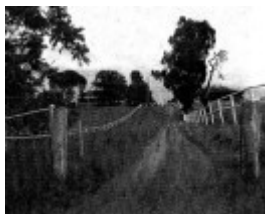
Thornholme, house and trees on left and stables on right of drive