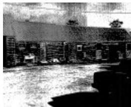
12.10 - Thornholme Residence 02 - Shire of Whittlesea Heritage Study 1991