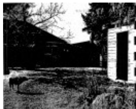
12.10 - Thornholme Residence 01 - Shire of Whittlesea Heritage Study 1991