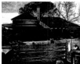
12.10 - Thornholme Residence - Shire of Whittlesea Heritage Study 1991