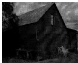
wool shed, from north-west with added skillion bay on south