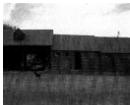
cart shed (altered) and stable complex to right