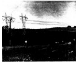
1 - Hawthorn Hedges in Kangaroo Ground03 - Shire of Eltham Heritage Study 1992