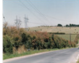
Hawthorn Hedges in Kangaroo Ground Colour 3 - Shire of Eltham Heritage Study 1992