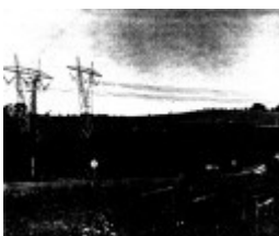
1 - Hawthorn Hedges in Kangaroo Ground03 - Shire of Eltham Heritage Study 1992