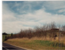
Hawthorn Hedges in Kangaroo Ground Colour 2 - Shire of Eltham Heritage Study 1992