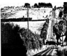
1 - Hawthorn Hedges in Kangaroo Ground - Shire of Eltham Heritage Study 1992