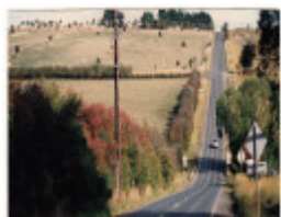
Hawthorn Hedges in Kangaroo Ground Colour 1 - Shire of Eltham Heritage Study 1992