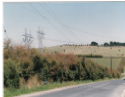
Hawthorn Hedges in Kangaroo Ground Colour 3 - Shire of Eltham Heritage Study 1992