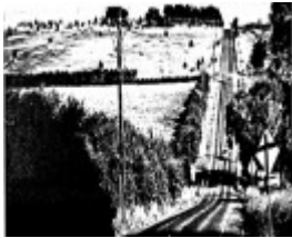
1 - Hawthorn Hedges in Kangaroo Ground - Shire of Eltham Heritage Study 1992