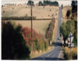
Hawthorn Hedges in Kangaroo Ground Colour 1 - Shire of Eltham Heritage Study 1992