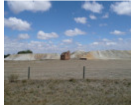
BERRY NO.1 DEEP LEAD GOLD MINE SOHE 2008