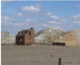
BERRY NO.1 DEEP LEAD GOLD MINE SOHE 2008