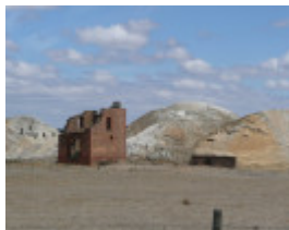
BERRY NO.1 DEEP LEAD GOLD MINE SOHE 2008