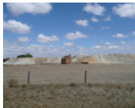
BERRY NO.1 DEEP LEAD GOLD MINE SOHE 2008