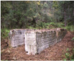
1 rose thistle & shamrock quartz mining precinct harrietteville lower treatment plant