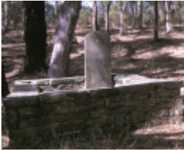
1 deadman's gully burial ground fryerstown grave stone