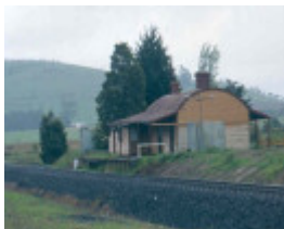
Gordon Railway Station 2004