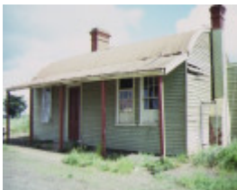
gordon railway station gowrie street gordon front view nov1986