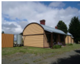
GORDON RAILWAY STATION SOHE 2008