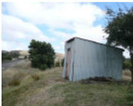
GORDON RAILWAY STATION SOHE 2008