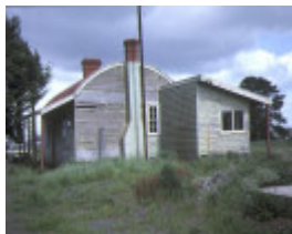
gordon railway station gowrie street gordon side view nov1986