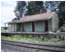
1 gordon railway station gowrie street gordon platform view nov1986