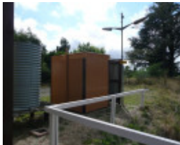
GORDON RAILWAY STATION SOHE 2008