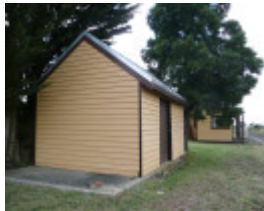
GORDON RAILWAY STATION SOHE 2008