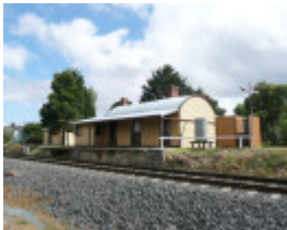
GORDON RAILWAY STATION SOHE 2008