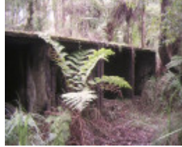
1 lower goodwood kilns upper l;a trobe valley piedmont front view aug1998