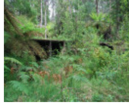
LOWER GOODWOOD KILNS SOHE 2008