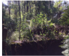
H1819 LOWER GOODWOOD KILNS LHA 2015 2.jpeg