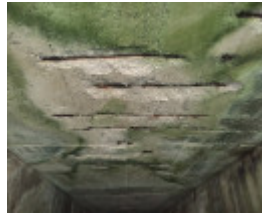
H1819 LOWER GOODWOOD KILNS LHA 2015 3.jpeg