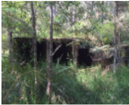
H1819 LOWER GOODWOOD KILNS LHA 2015 1.jpeg