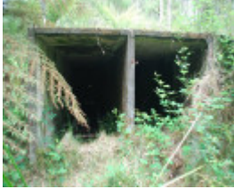
LOWER GOODWOOD KILNS SOHE 2008