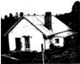
73 - Souter House 19 Falkiner St Eltham_04 - North West (rear corner) of the Souter House in 1949 - Shire of Eltham Heritage Study 1992