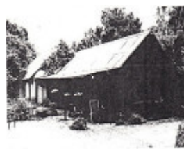
Souter House 19 Falkiner St Eltham Black & White 1 - Shire of Eltham Heritage Study 1992