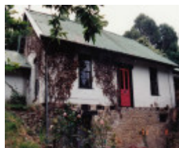
Souter House 19 Falkiner St Eltham Colour 1 - Shire of Eltham Heritage Study 1992