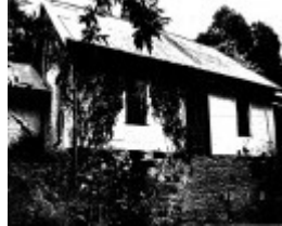
73 - Souter House 19 Falkiner St Eltham_07 - Shire of Eltham Heritage Study 1992