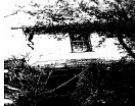
73 - Souter House 19 Falkiner St Eltham_05 - Original outside entry to the basement floor at the south east corner of the building in 1949. The ground in front of the Souter House was excavated and removed in recent years by the present owners - Shire of