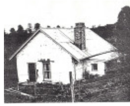
Souter House 19 Falkiner St Eltham Black & White 2 - Shire of Eltham Heritage Study 1992