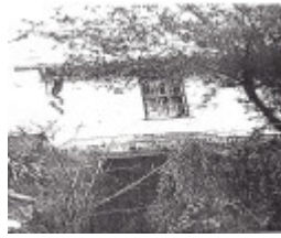
Souter House 19 Falkiner St Eltham Black & White 3 - Shire of Eltham Heritage Study 1992