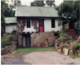
Souter House 19 Falkiner St Eltham Colour 3 - Shire of Eltham Heritage Study 1992