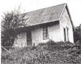
Souter House 19 Falkiner St Eltham Black & White 4 - Shire of Eltham Heritage Study 1992