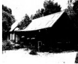
73 - Souter House 19 Falkiner St Eltham_03 - Souter House present day - Shire of Eltham Heritage Study 1992