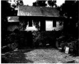
73 - Souter House 19 Falkiner St Eltham - Shire of Eltham Heritage Study 1992