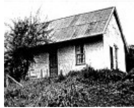
73 - Souter House 19 Falkiner St Eltham_02 - Souter House in 1949 - Shire of Eltham Heritage Study 1992