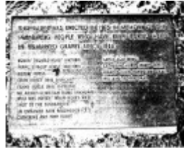
81 - Hurst Family Cemetery Greysharps Rd_02 - Shire of Eltham Heritage Study 1992