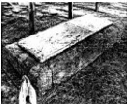
81 - Hurst Family Cemetery Greysharps Rd_04 - Shire of Eltham Heritage Study 1992