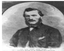
81 - Hurst Family Cemetery Greysharps Rd_05 - Henry Facey Hurst, this private cemetery was established following his death in 1866 (ELHPC NO.1062) - Shire of Eltham Heritage Study 1992