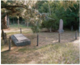
Hurst Family Cemetery Greys Harps Rd Colour 1 - Shire of Eltham Heritage Study 1992