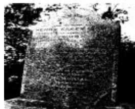
81 - Hurst Family Cemetery Greysharps Rd_08 - Shire of Eltham Heritage Study 1992