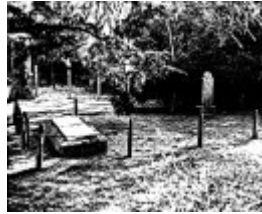
81 - Hurst Family Cemetery Greysharps Rd_03 - Shire of Eltham Heritage Study 1992