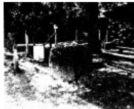
81 - Hurst Family Cemetery Greysharps Rd_06 - Shire of Eltham Heritage Study 1992