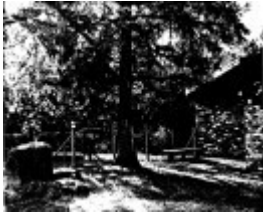
81 - Hurst Family Cemetery Greysharps Rd - Shire of Eltham Heritage Study 1992