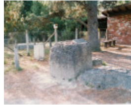
Hurst Family Cemetery Greys Harps Rd Colour 3 - Shire of Eltham Heritage Study 1992