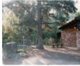
Hurst Family Cemetery Greys Harps Rd Colour 7 - Shire of Eltham Heritage Study 1992