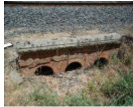
PORCUPINE HILL RAILWAY PRECINCT (MURRAY VALLE RLWY, MELB TO ECHUCA) SOHE 2008