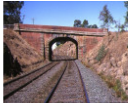
1 porcupine hill railway precinct ravenswood bridge front view apr1998