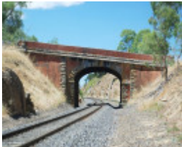
PORCUPINE HILL RAILWAY PRECINCT (MURRAY VALLE RLWY, MELB TO ECHUCA) SOHE 2008