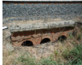
PORCUPINE HILL RAILWAY PRECINCT (MURRAY VALLE RLWY, MELB TO ECHUCA) SOHE 2008