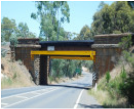
HARCOURT RAILWAY PRECINCT (MURRAY VALLEY RAILWAY, MELBOURNE TO ECHUCA) SOHE 2008