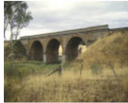
1 harcourt railway precinct harcourt side view apr1998