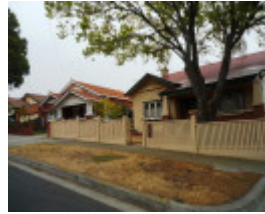
Reaburn Crescent Precinct