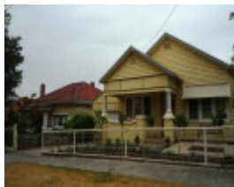
Reaburn Crescent Precinct