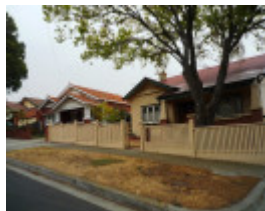
Reaburn Crescent Precinct