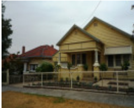
Reaburn Crescent Precinct