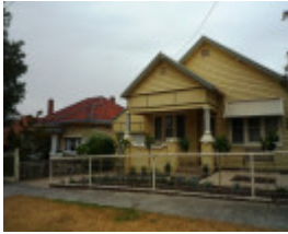
Reaburn Crescent Precinct