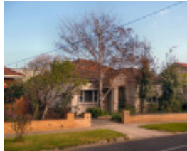
No 83 Gordon Street.JPG