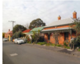
Louisa Street, Brunswick(1).JPG