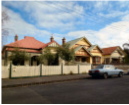
Edmends Street, Brunswick.JPG