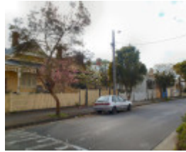
Stewart Street, Brunswick.JPG