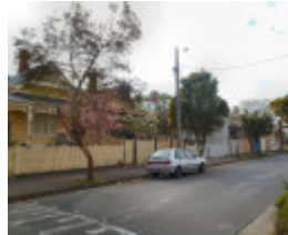
Stewart Street, Brunswick.JPG