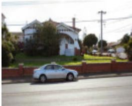
483 Brunswick Rd West