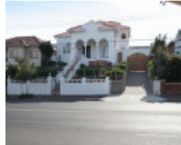
485 Brunswick Rd West