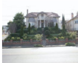
489 Brunswick Rd West