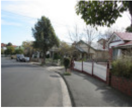
Collier Cr looking E