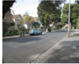
Collier Cr looking E(2)