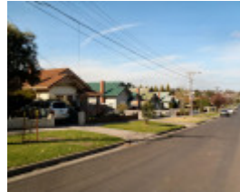
Carrington Street Coburg.JPG