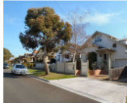
Grundy Grove Coburg.JPG