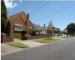
Graham St Pascoe Vale South.JPG