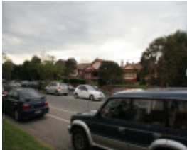
Mid-Park St looking W