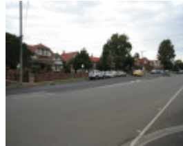
Park Street looking E