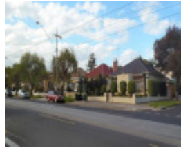
Melville Road and Princes Terrace Coburg