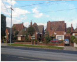
Melville road between Princes and Brearley Coburg