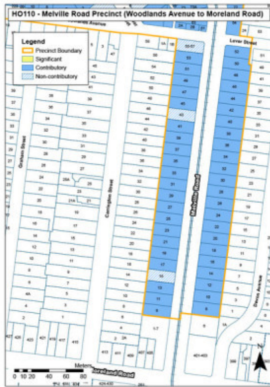
Melville Road Precinct (Woodlands Avenue to Moreland Road) Map