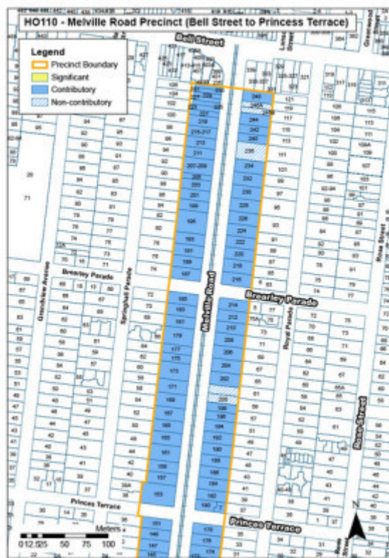
Melville Road Precinct (Bell Street to Princess Terrace) Map