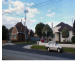
Melville road between Princes and Brearley Coburg