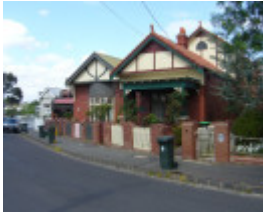
Willowbank Rd (3)