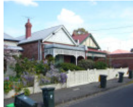
Willowbank Rd (2)