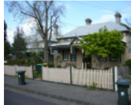
Willowbank Rd (1)