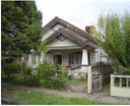
French Avenue Precinct