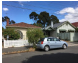
Hickford Street Precinct