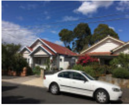
Hickford Street Precinct