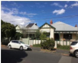
Hickford Street Precinct