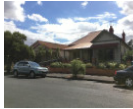
Hickford Street Precinct