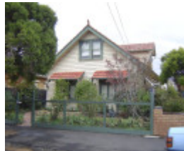
Hickford Street Precinct