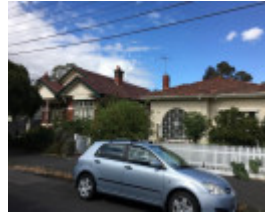
Hickford Street Precinct