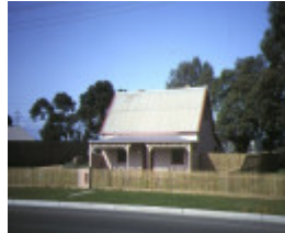
1 german cottage torquay road grovedale front view sep1991