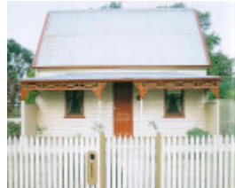
german cottage torquay road grovedale front view publication