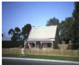
1 german cottage torquay road grovedale front view sep1991