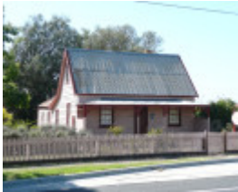
GERMAN COTTAGE SOHE 2008