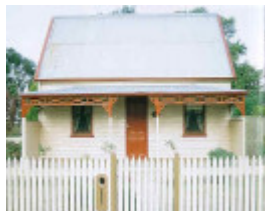
german cottage torquay road grovedale front view publication