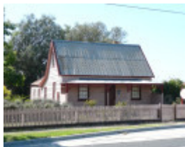
GERMAN COTTAGE SOHE 2008