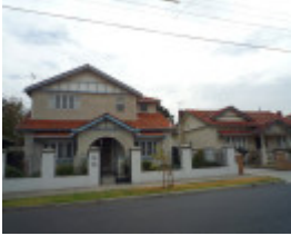
Sumner Estate Precinct