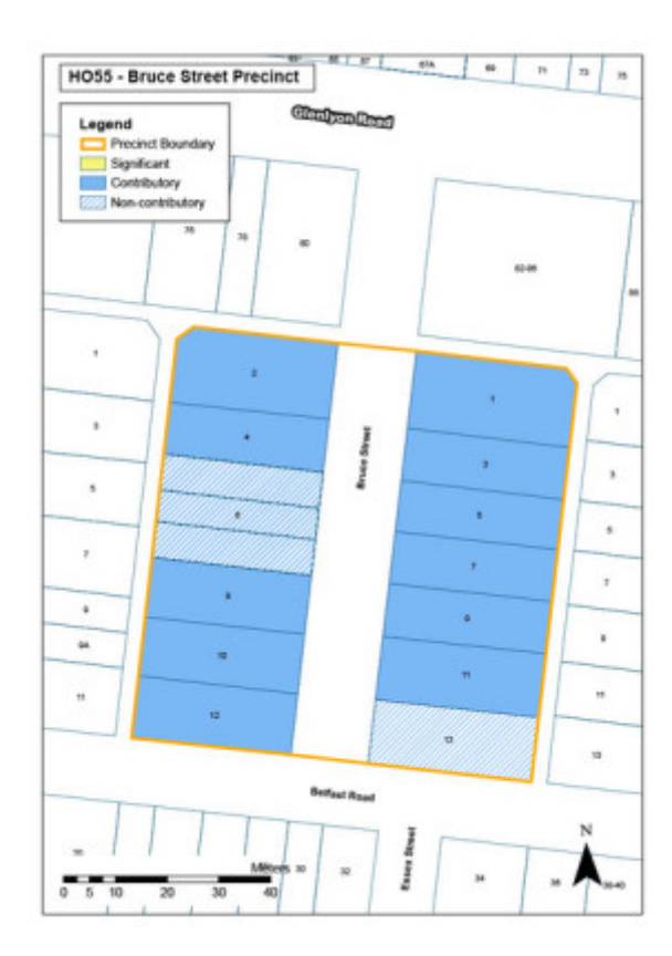
Bruce Street Precinct Map