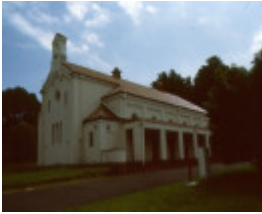
1 mont park ernest jones hall