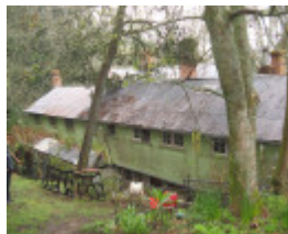
Fontainebleau_guest house wing from south_KJ_Sept 09