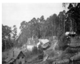
McCubbin_fontainebleau early photo c1920.jpg