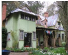
Fontainebleau_view from front with second guest house wing on left_KJ_Sept 09