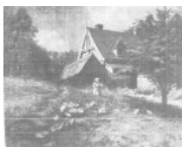
Fontainebleau_as painted by McCubbin