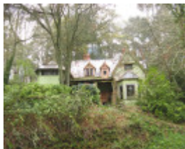
Fontainebleau_view from north_KJ_Sept 09