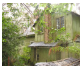
Fontainebleau_west end of rear guest house wing_KJ_Sept 09