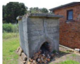
H1778 WONTHAGGI STATE COAL MINE CENTRAL PRECINCT LHA 2015 6.JPG