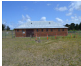
H1778 WONTHAGGI STATE COAL MINE CENTRAL PRECINCT LHA 2015 4.JPG