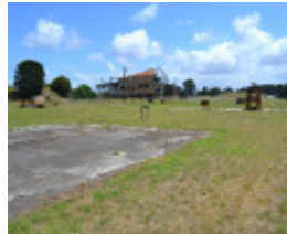
H1778 WONTHAGGI STATE COAL MINE CENTRAL PRECINCT LHA 2015 1.JPG