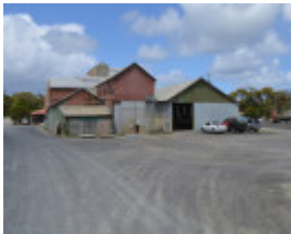
H1778 WONTHAGGI STATE COAL MINE CENTRAL PRECINCT LHA 2015 2.JPG