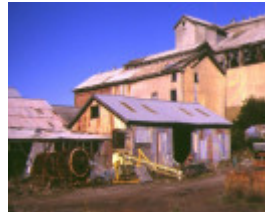
1 wonthaggi state coal mine central precinct side view jul1998