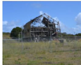
H1778 WONTHAGGI STATE COAL MINE CENTRAL PRECINCT LHA 2015 3.JPG