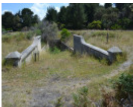
H1778 WONTHAGGI STATE COAL MINE CENTRAL PRECINCT LHA 2015 5.JPG