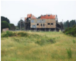
WONTHAGGI STATE COAL MINE CENTRAL PRECINCT SOHE 2008