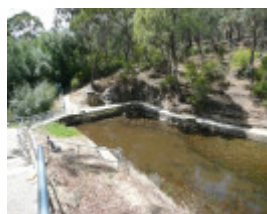
SWIMMING POOL SOHE 2008