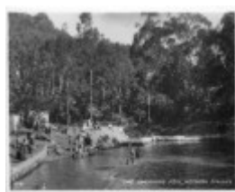
1 hepburn pool slv 1938