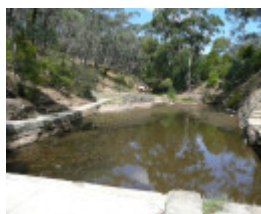
SWIMMING POOL SOHE 2008