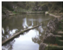
hepburn swimming pool interior wall ms sept1999