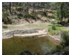
SWIMMING POOL SOHE 2008