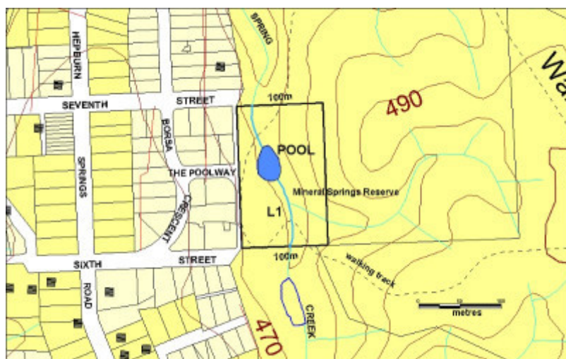
hepburn pool plan