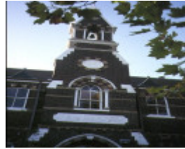
primary school number 1467 malvern road hawthorn detail of bell tower