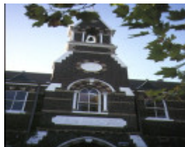
primary school number 1467 malvern road hawthorn detail of bell tower