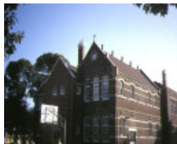
primary school number 1467 malvern road hawthorn rear view 1994