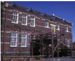
primary school number 1467 malvern road hawthorn side view entrance