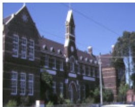
1 primary school number 1467 malvern road hawthorn front view nov1984