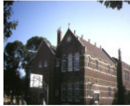
primary school number 1467 malvern road hawthorn rear view 1994