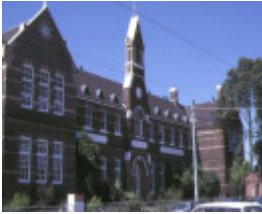
1 primary school number 1467 malvern road hawthorn front view nov1984