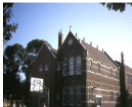
primary school number 1467 malvern road hawthorn rear view 1994