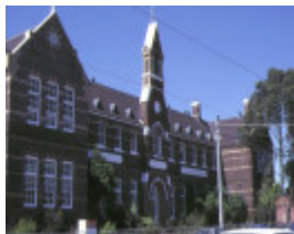
1 primary school number 1467 malvern road hawthorn front view nov1984