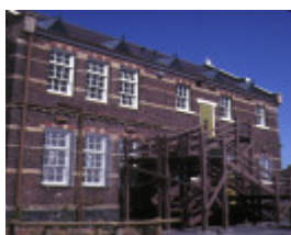
primary school number 1467 malvern road hawthorn side view entrance