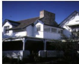
glenfern east st kilda side view