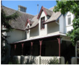
GLENFERN SOHE 2008