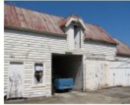
GLENFERN SOHE 2008