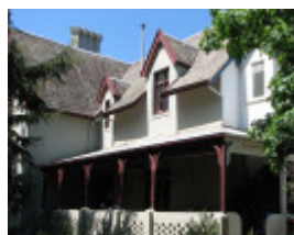
GLENFERN SOHE 2008