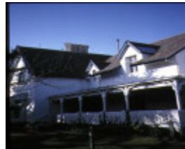
1 glenfern east st kilda front view