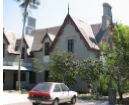
GLENFERN SOHE 2008