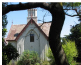
GLENFERN SOHE 2008