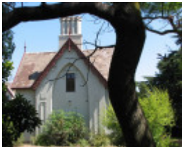
GLENFERN SOHE 2008