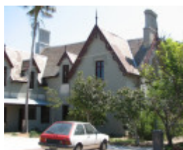
GLENFERN SOHE 2008