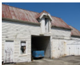
GLENFERN SOHE 2008