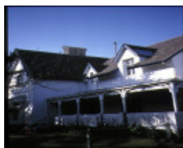
1 glenfern east st kilda front view