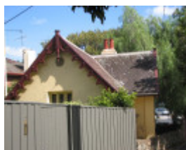
FORMER INVERGOWRIE LODGE SOUTH ELEVATION