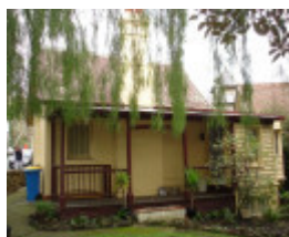
H0517 facade from Burwood Road