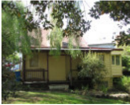
FORMER INVERGOWRIE LODGE NORTH ELEVATION