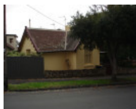
H0517 View from Coppin Grove