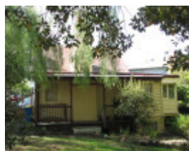
FORMER INVERGOWRIE LODGE NORTH ELEVATION