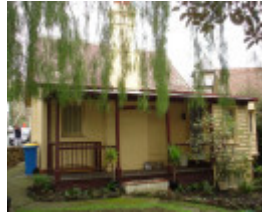
H0517 facade from Burwood Road