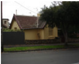
H0517 View from Coppin Grove