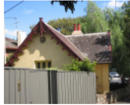
FORMER INVERGOWRIE LODGE SOUTH ELEVATION