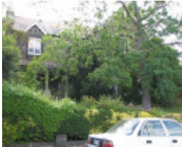
THE HAWTHORNS SOHE 2008