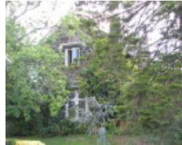
THE HAWTHORNS SOHE 2008