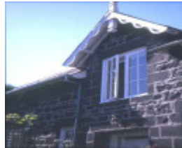
h00457 the hawthorns creswick st hawthorn upper front window