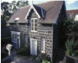
the hawthorns hawthorn former stables jun1978