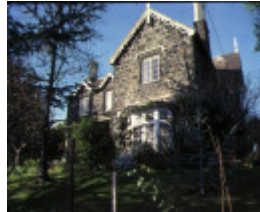
1 the hawthorns hawthorn front view jun1978