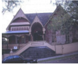
h00552 1 alloarmo grattan st hawthorn external front view she project 2003