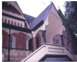
alloarmo grattan st hawthorn front gables she project 2003