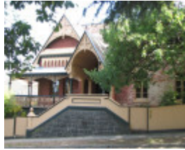
ALLOARMO SOHE 2008