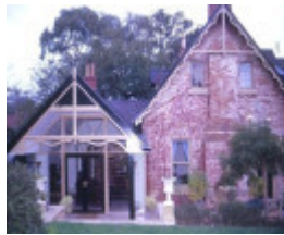
alloarmo grattan st hawthorn rear view she project 2003