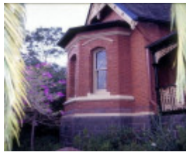
alloomo grattan st hawthorn bay window she project 2003