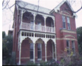
1 immigration reception centre hawthorn front view jun1984