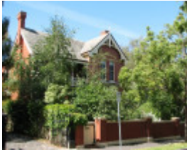
SHENTON SOHE 2008