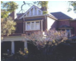
h00788 shenton kinkora rd hawthorn rear view