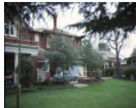
immigration reception centre hawthorn rear garden jun1984