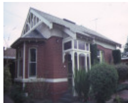
immigration reception centre hawthorn side view