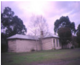
healesville railway station complex heasleville kinglake road healesville front view jun1995