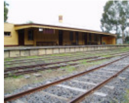
healesville railway station