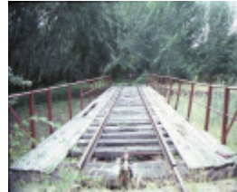
healesville railway station compelx healesville kinglake road healesville tracks feb1985