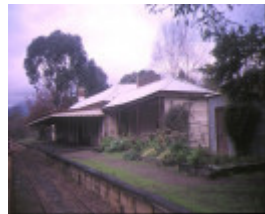
1 healesville railway station compelx healesville kinglake road healesville station building jun1995