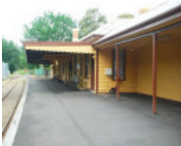
HEALESVILLE RAILWAY STATION COMPLEX SOHE 2008