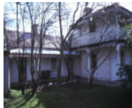
innisfail heathcote rear view aug1979