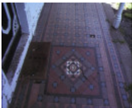
innisfail heathcote detail of- tiled verandah aug1979