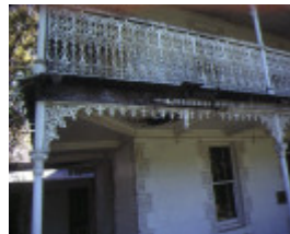
innisfail heathcote detail lacework oct1980