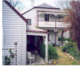
h00388 innisfail high street heathcote view from high street she project 2003