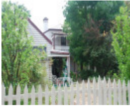
INNISFAIL SOHE 2008