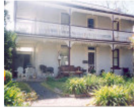
h00388 1 innisfail high street heathcote view from driveway she project 2003