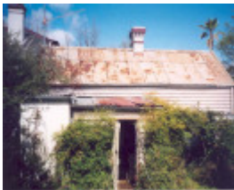
h00388 innisfail high street heathcote original maids quarters she project 2003