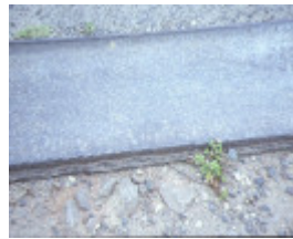
market gardeners tram plateway centre dandenong road heatherton top view of plateway 1992