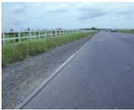
1 market gardeners tram plateway centre dandenong road heatherton front view of road