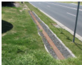
MARKET GARDENERS TRAM PLATEWAY SOHE 2008