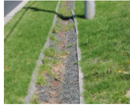
MARKET GARDENERS TRAM PLATEWAY SOHE 2008