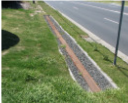
MARKET GARDENERS TRAM PLATEWAY SOHE 2008