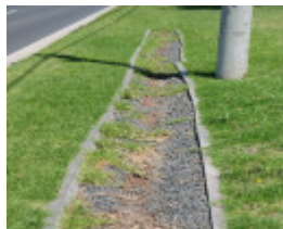
MARKET GARDENERS TRAM PLATEWAY SOHE 2008