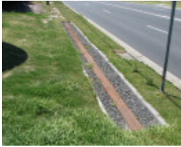
MARKET GARDENERS TRAM PLATEWAY SOHE 2008