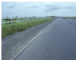
1 market gardeners tram plateway centre dandenong road heatherton front view of road