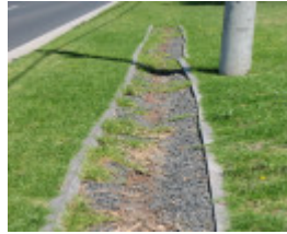
MARKET GARDENERS TRAM PLATEWAY SOHE 2008