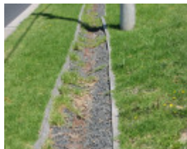
MARKET GARDENERS TRAM PLATEWAY SOHE 2008