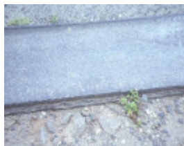
market gardeners tram plateway centre dandenong road heatherton top view of plateway 1992