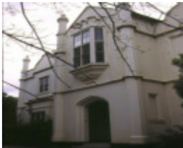
banyule heidelberg main entry sep1995