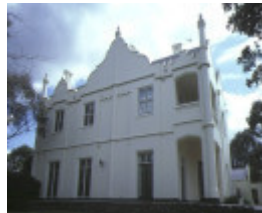
banyule heidleberg side view sep1984