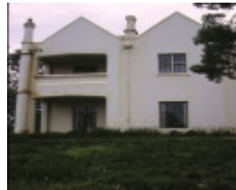
banyule heidelberg 1908 additions sep1995