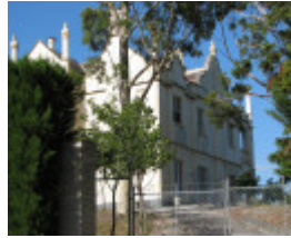
BANYULE SOHE 2008