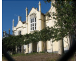
BANYULE SOHE 2008