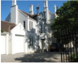
BANYULE SOHE 2008