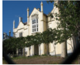
BANYULE SOHE 2008