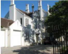
BANYULE SOHE 2008