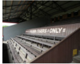
Bridges Reserve and City Oval