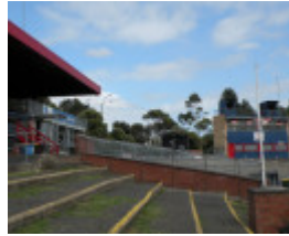
Bridges Reserve and City Oval