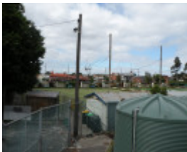
Bridges Reserve and City Oval