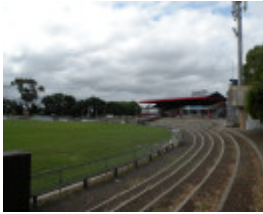
Bridges Reserve and City Oval