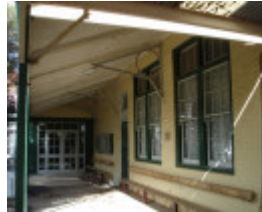
High School Maryborough verandah_KJ_26 Jul 07