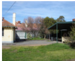
high school Maryborough courtyard KJ 26 Jul 07 36