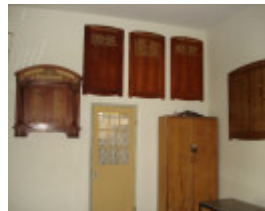
High School Maryborough Honour Boards_KJ_26 Jul 07