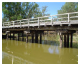
h01850 1 danns bridge over bet bet creek dunolly eddington road eddington close view she project 2004