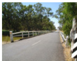
h01850 danns bridge over bet bet creek dunolly eddington road eddington across bridge she project 2004