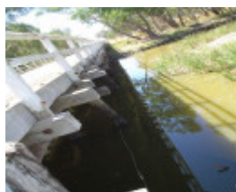
h01850 danns bridge over bet bet creek dunolly eddington road eddington railings she project 2004