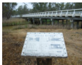
DANNS BRIDGE SOHE 2008