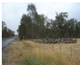
DANNS BRIDGE SOHE 2008