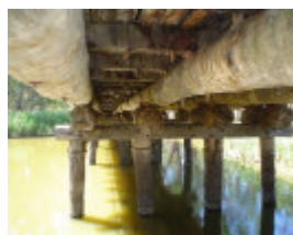
h01850 danns bridge over bet bet creek dunolly eddington road eddington underneath she project 2004