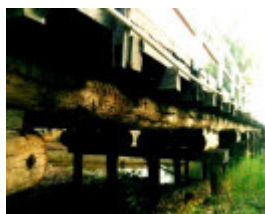
h01850 danns river bridge ntv