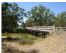
h01850 danns bridge over bet bet creek dunolly eddington road eddington long view she project 2004